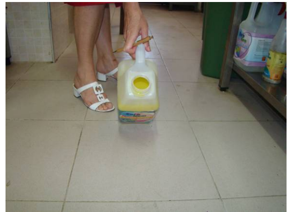
Visit of the trainer, Mrs. Aida Szilagyi with the national auditors/experts and the NCPP staff at the hotel resort “At Stela”

Please find attached the Annex 10_ Agenda, Photo documentation of the Follow up Trainings – 8 th –9 th July 2010