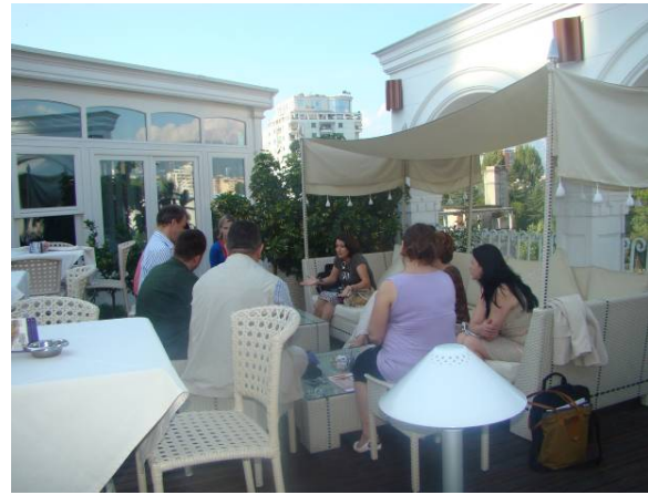
Informal discussion among the Albanian national CP auditors/experts and the UNEP and UNIDO representatives

Please find attached the Annex 9_ Agenda and Photo documentation -Follow up Training 6th – 7th July 2010