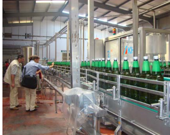
International expert, NCPP team and national CP experts during a site visit at “Stefani & CO”