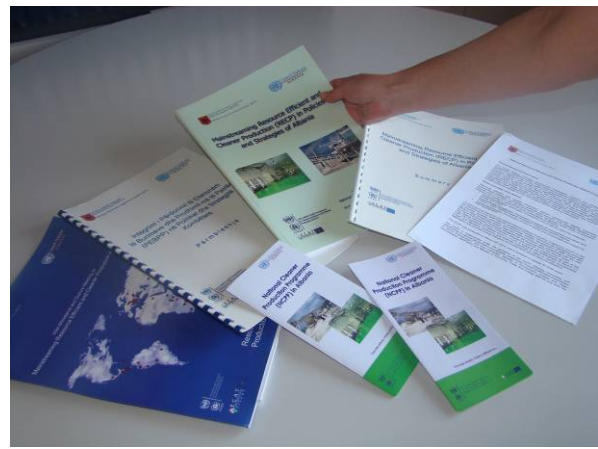
Leaflets, fact sheets and RECP Strategy