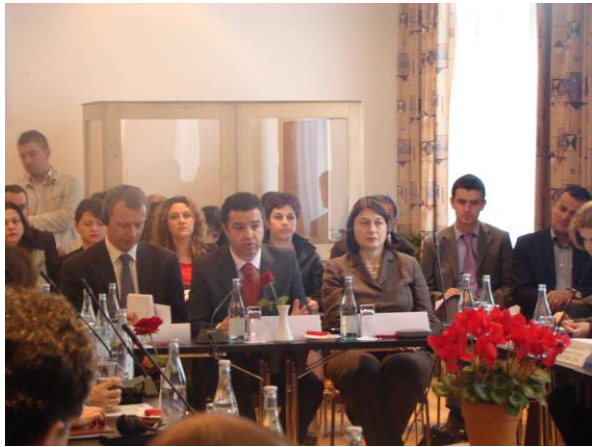
Mr. Eno Bozdo, Deputy Minister of Economy, Trade and Energy Environment, during the opening speech