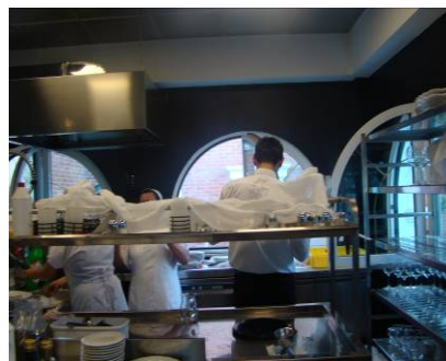
The national CP experts during a site visit at “Xheko Imperial” hotel