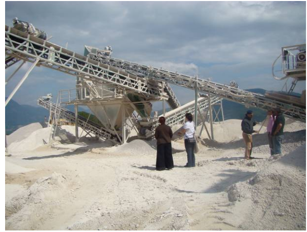
Visit to the “Pashkashesh” Cement company - Mining and Processing Sector

This first round was followed by a second one during the months of September 2010 – February 2011. Please find attached The Annex 6_Visits to the selected companies