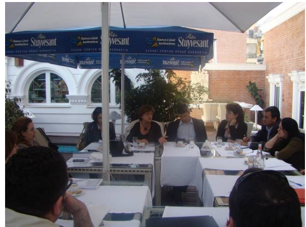
National CP experts and NCPP team during the round table discussions

The supervision process has continued with other periodical meetings that have been organized by the NCPP team, where the main objective has been the follow up of the work of the experts.