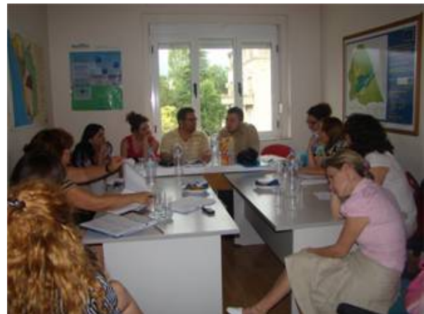
National CP experts and NCPP team during the 30 th June 2010 meeting