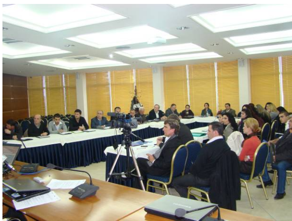
Participants during the workshop in Shkodra

The third information awareness workshop on NCPP targeted mainly the interested Albanian businesses, local government and other relevant actors located in the northern part of Albania. The workshop provided detailed information on the Albanian NCPP programme by emphasising what has been done and the foreseen upcoming phases. Apart of the awareness raising aspect the workshop was used as a possibility to learn from the other NCPP programmes in the neighbouring countries including the success stories and the concrete benefits that the business could have from the participation in this programme. Just like in the case of the workshop organised in the Vlora in December 2010 in this workshop was also noted a very high level of interest on the programme by several representatives of different companies operating in the northern part of Albania being this another additional positive indicator for the future inclusion in the programme of companies located in this area of Albania.