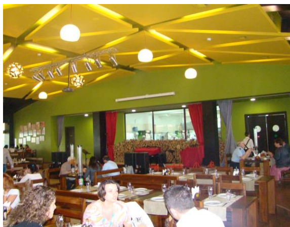
The national CP expert during a site visit at "At Stela" resort