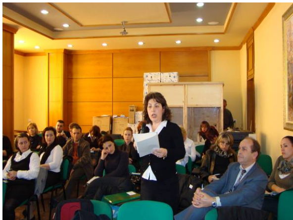
Conclusions of the discussions of first working group Industry