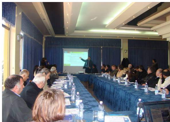
Mr René Van Berkel, UNIDO during the presentation of Resource Efficient and Cleaner Production: concepts, methods and benefits

different companies operating in the southern part of Albania being it a very positive indicator for the future inclusion of companies operating in this area in the next phases of the programme implementation