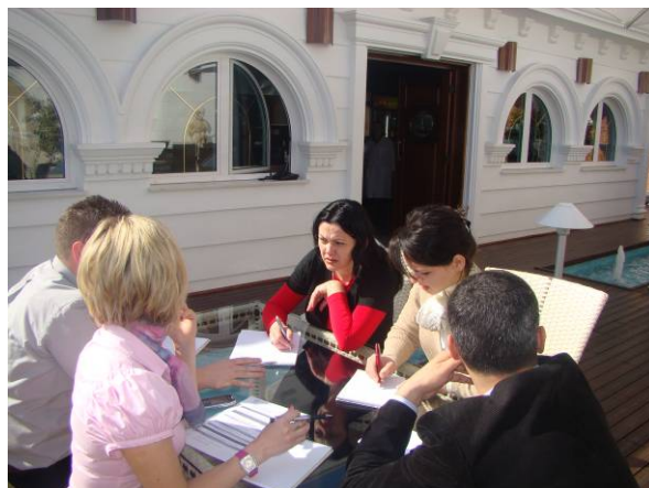
National CP Experts during a consultation meeting

Following an intensive schedule of trainings and demanding input and performance a first group of 12 National CP Experts has been trained. Therefore a first group of National CP Experts trained under the programme was established. These National CP Experts are professionals from the Tirana University, Natural Science Faculty (5 trainees), Businesses (4 trainees), Public Administration (1 trainee) and Associations (1 trainee). The list of the National CP Experts is introduced here below: