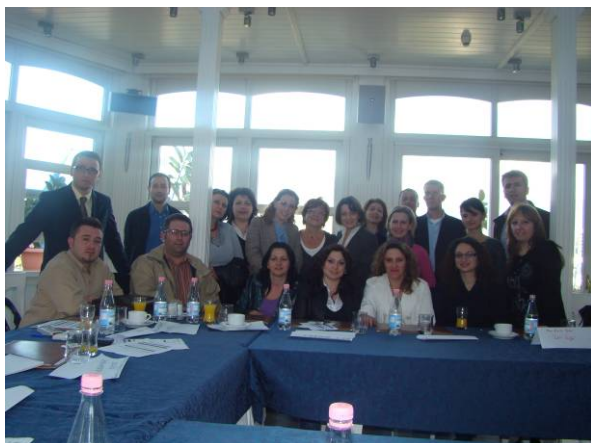
Photo of the initial group of professionals