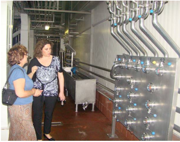
Visit to the “Stefani & Co” - Food and Agro-processing Sector Minerals