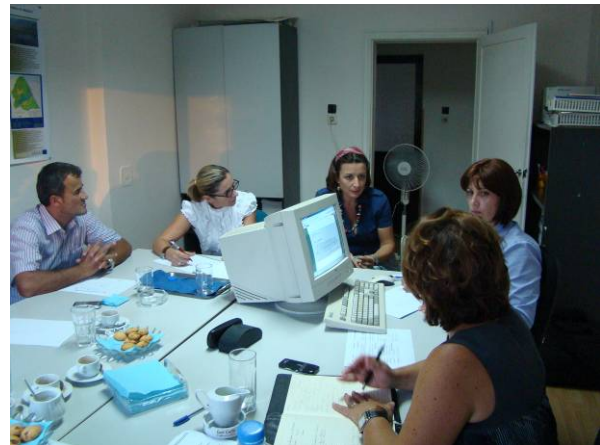
National CP experts and NCPP team during the 5 th September 2010 meeting

Please find attached the Annex 5_List of participants, Minutes of the meeting and Photo documentation of the mayor official meeting with the national CP experts