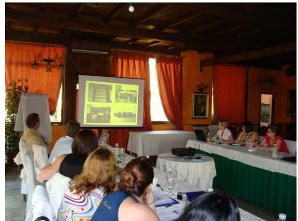
Presentations of the National CP Experts during the 5th July 2010 training

Discussions between all the National CP Auditors/Experts and international experts took place to clarify the confusion on the information required.