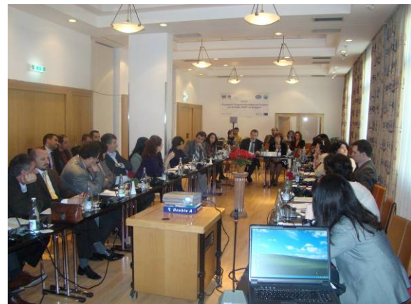
Participants during the Information Awareness Workshop in Tirana

This was the first information awareness workshop on NCPP was organised with the participation of the interested Albanian businesses located in the Tirana and Durres regions as well as other relevant stakeholders. During the Information Awareness workshop was provided detailed information on the Albanian NPPC programme. Apart of the awareness raising aspect the meeting was used as a possibility to learn from the other NPPC programmes in the neighbouring countries including the success stories and the concrete benefits that the business could have form the participation in this programme.