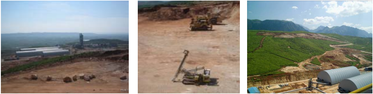
Views from "Antea" Sh.a